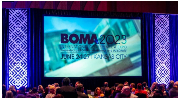
EXHIBIT SPACE PRICING AND MEMBERSHIP

Booth space is based on 10'x10' booths (100 square feet). Booth fees are as follows*: