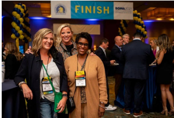
EXHIBIT SPACE PRICING AND MEMBERSHIP

Booth space is based on 10'x10' booths (100 square feet). Booth fees are as follows*: